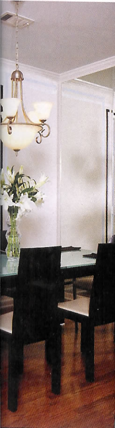
LIVING ROOM (left)

Entertainment center $899; Art $886; Chairs $1,198; Sofa $1,250; Shelves $900; Desk chair $251; House $345; Table lamp $135